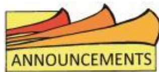
Table Talk with Pastor will resume this Wednesday, April 22 at 7PM. Th topic is Jacob.

Ministry Board Meeting. There will be Ministry Boar meeting this Thursday, April 23 @7PM. Please meet in the conference room off the office.